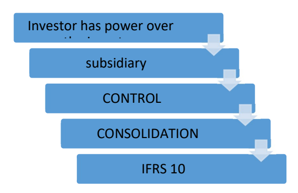
Figure 1. Control and Consolidation

If the investor has power over the investee, then the investor is called "parent"; the investee is called "subsidiary" and the investor has control over the subsidiary. The accounting method will be "consolidation" according to IFRS 10.